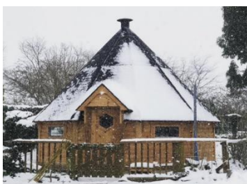
The Friars' outdoor classroom looked even more beautiful this week.